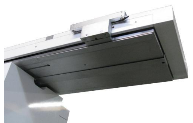
Illustration 6.2: Electromechanical safety switch at a Blockexamination unit

Should the chair be used with any other units then it is imperative to give regard to the respective safety standards. The utilised propulsion units ensure a long and maintenance free function.