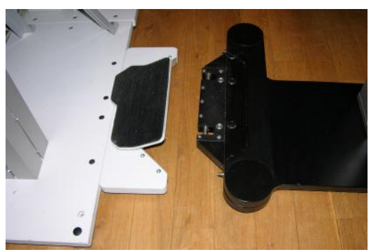
Illustration 5.1: Slide Mechanism

The changing of seats for wheel chair patients into the refractions and patient chair can be a very troublesome and needlessly strains the patient. In order to avoid this it is possible with the refractions and patient chair Vito to fit them with a slide mechanism for wheel chair patients (no retrofit possible) (see Illustration 5.1).